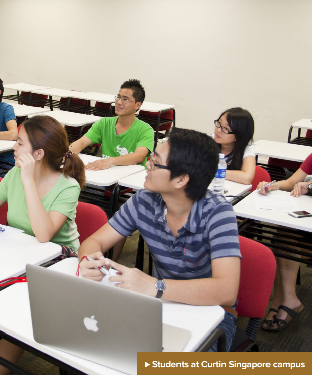
► Students at Curtin Singapore campus