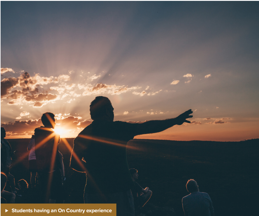
► Students having an On Country experience