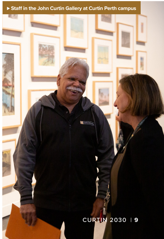
► Staff in the John Curtin Gallery at Curtin Perth campus