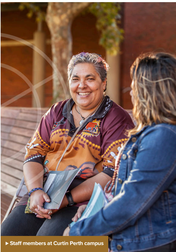
► Staff members at Curtin Perth campus