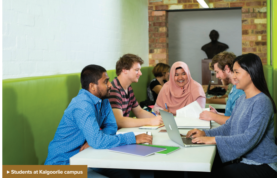
► Students at Kalgoorlie campus