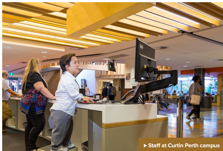
► Staff at Curtin Perth campus

Working in partnership we will make a difference for people and our planet.