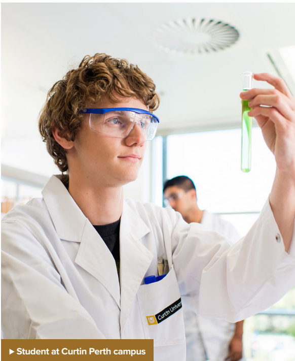
► Student at Curtin Perth campus

Our Partnership theme focuses on working in partnership with students, alumni, communities, industry, and other stakeholders to make a difference. Curtin seeks to extend its ways of engagement to nurture relationships that enable value creation for our partners and the University, and will ensure that we develop solutions which make a real-world difference to solving global challenges.