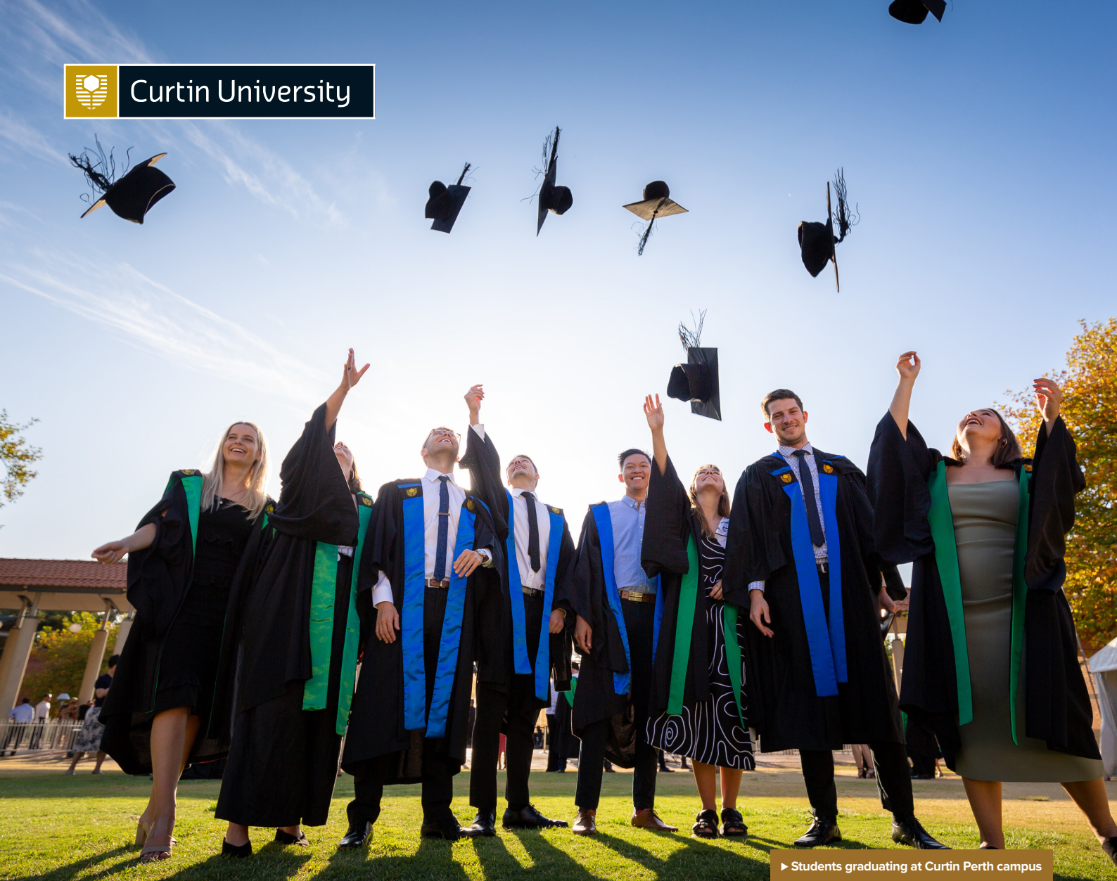
► Students graduating at Curtin Perth campus