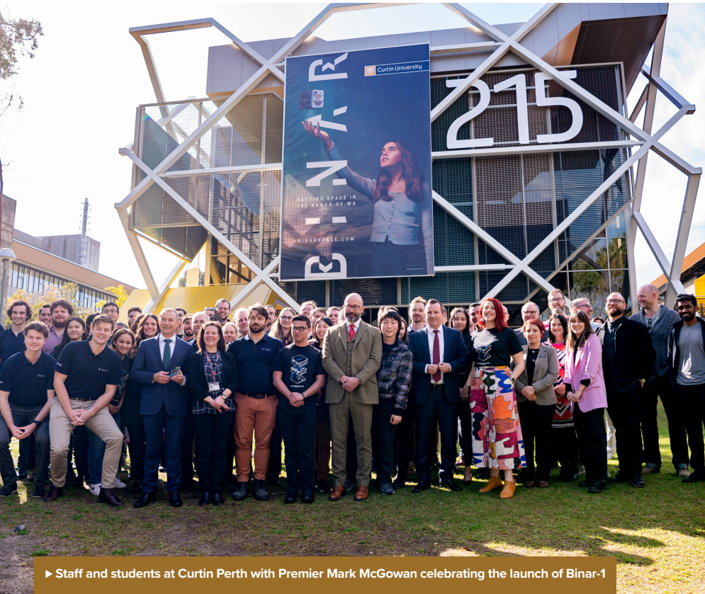
► Staff and students at Curtin Perth with Premier Mark McGowan celebrating the launch of Binar-1