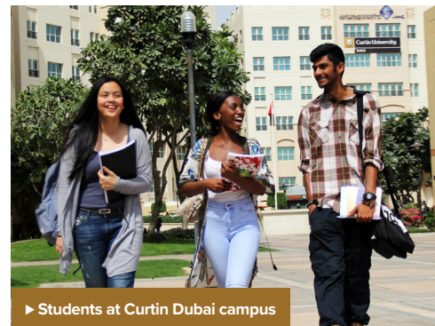
► Students at Curtin Dubai campus