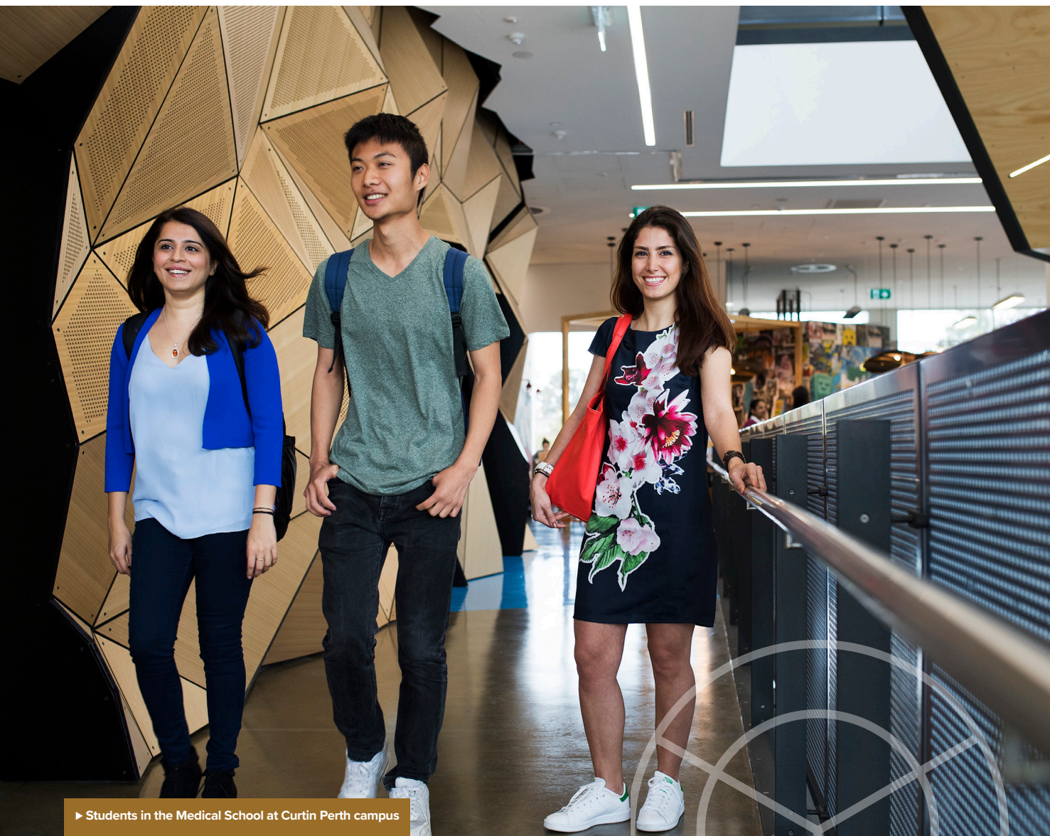
► Students in the Medical School at Curtin Perth campus