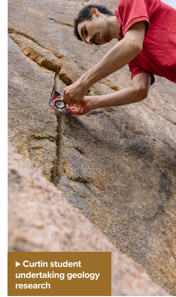
► Curtin student undertaking geology research

Our strategic theme Planet focuses on continuing Curtin's journey as a global university, and strengthens our commitment to social good, sustainability, and global impact.