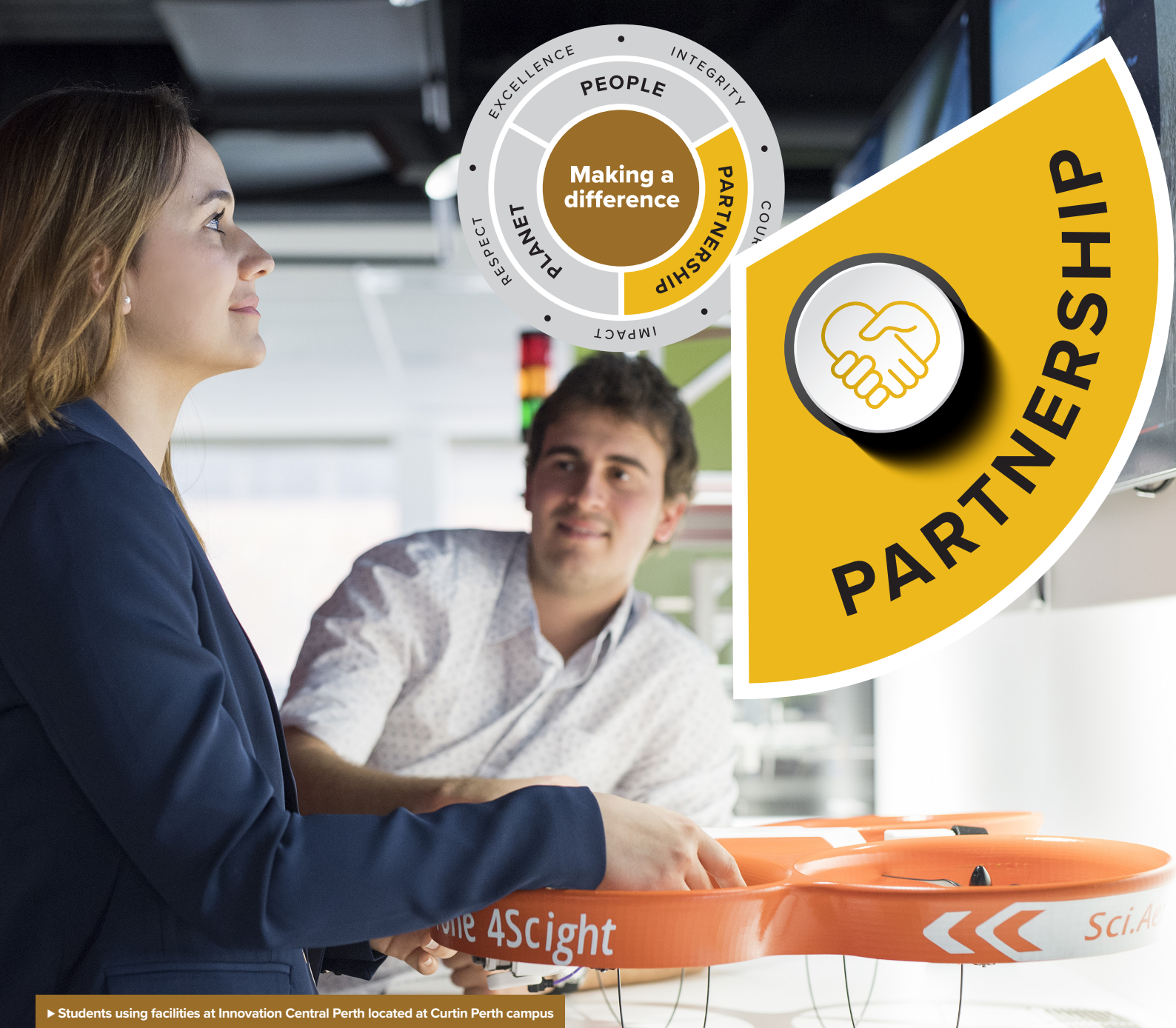
► Students using facilities at Innovation Central Perth located at Curtin Perth campus