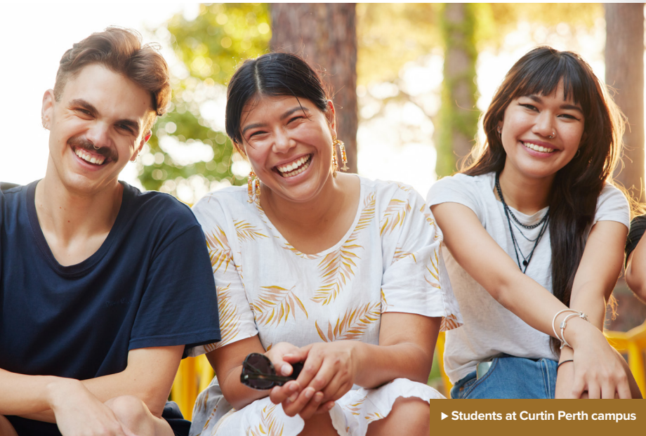
► Students at Curtin Perth campus