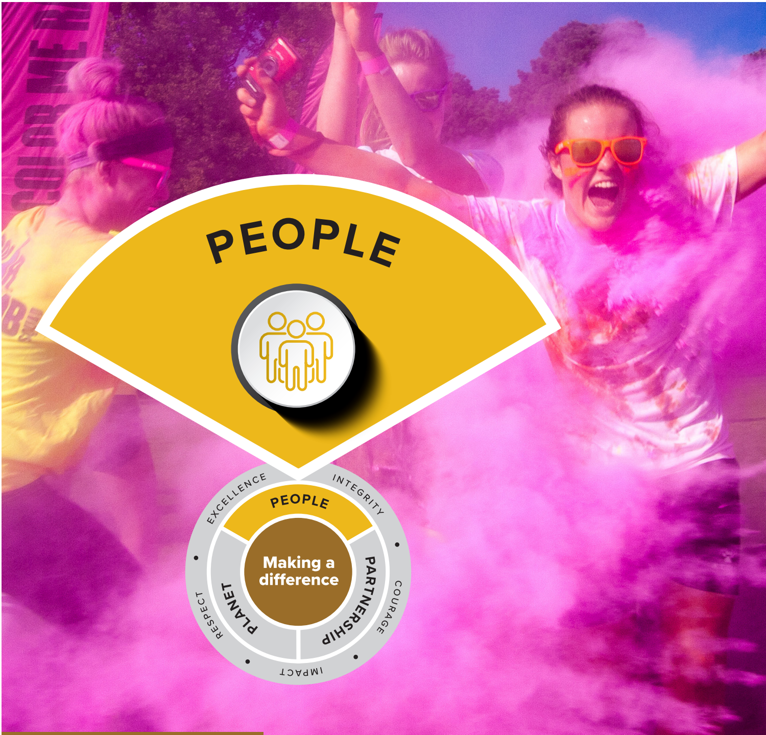
► Students from Curtin Perth participating in Colour Me Rad