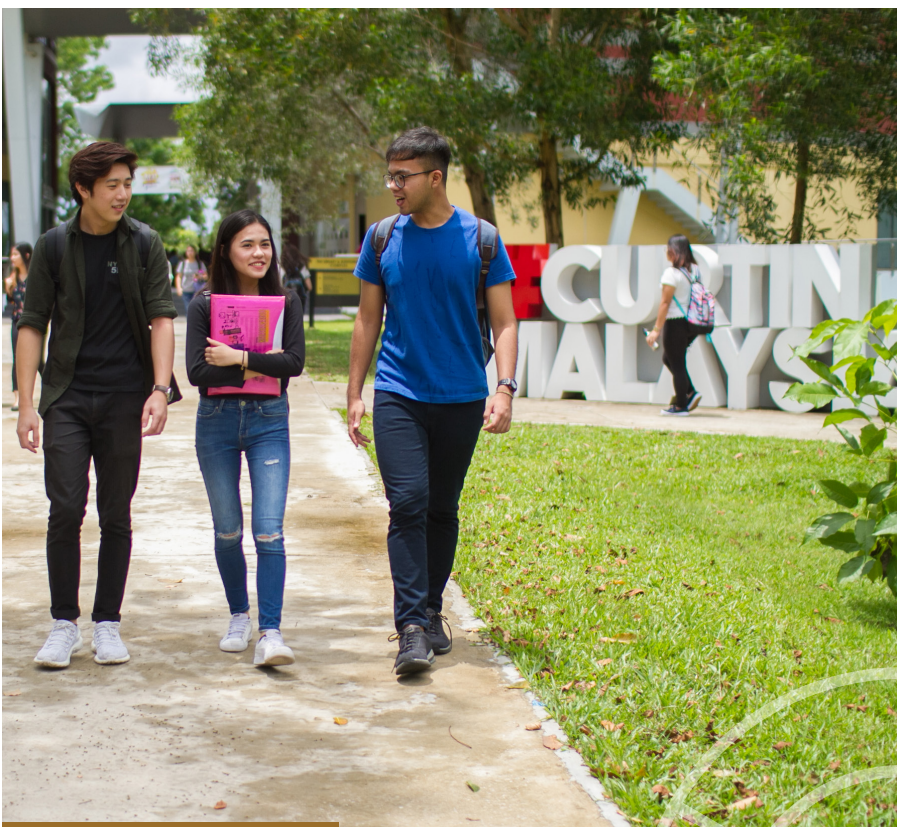
► Students at Curtin Malaysia campus